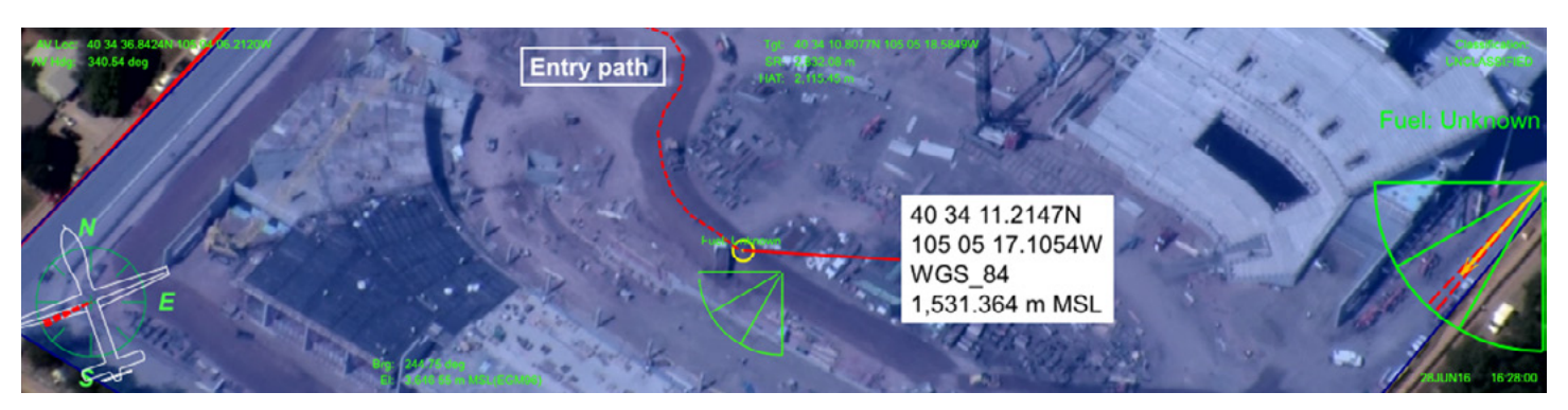
Analysis of video surveillance on a construction site; imagery courtesy of L-3 Communications, EO/IR Inc.